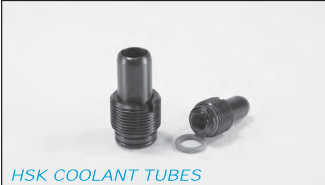
HSK COOLANT TUBES