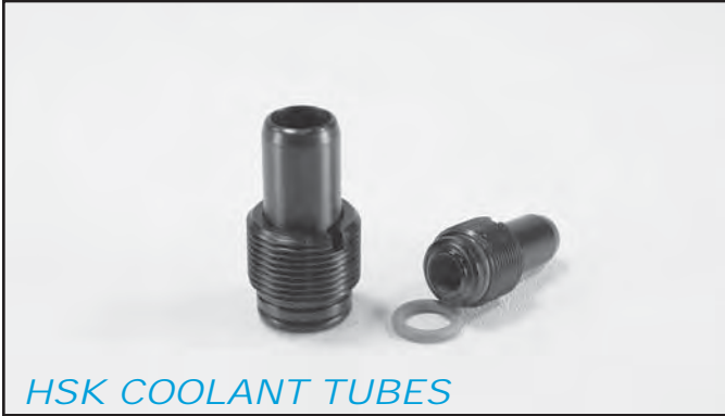
HSK COOLANT TUBES