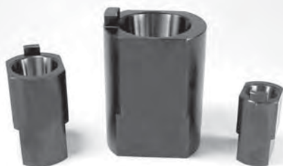
TOOL HOLDING FIXTURES

Spindle Wipes assure the most important connection - the one between the spindle and toolholder, is free of contaminants allowing continuous positive contact.