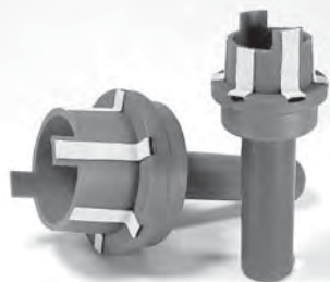
HSK SPINDLE WIPES