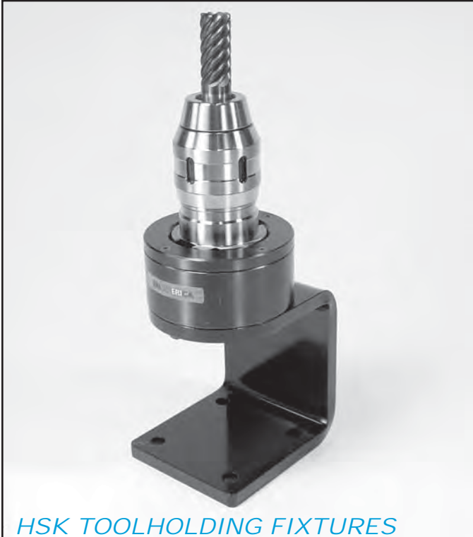
HSK TOOLHOLDING FIXTURES